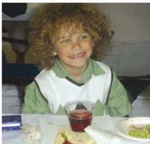
"When a child's stomach is empty, everything else is secondary."